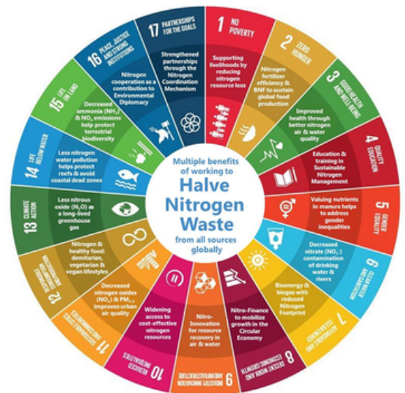
Nitrogen is everywhere, yet invisible, across the UN Sustainable Development Goals (SDGs).

Session 2, focused on what is needed from the Inter-convention Nitrogen Co-ordination Mechanism (INCOM), with input from UN Conventions and Programmes. This presented an opportunity for Member States to provide interventions, with several countries contributing comments, including: India, Sri Lanka, Romania, and Germany.